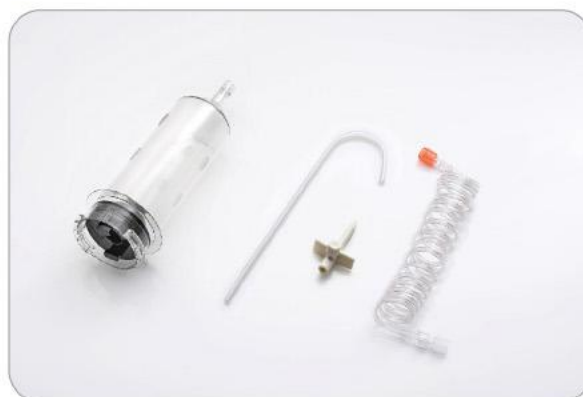
· 200ml Syringe for Contrast